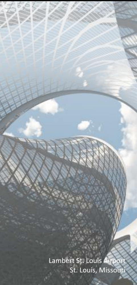
Lambert St. Louis Airport St. Louis, Missouri