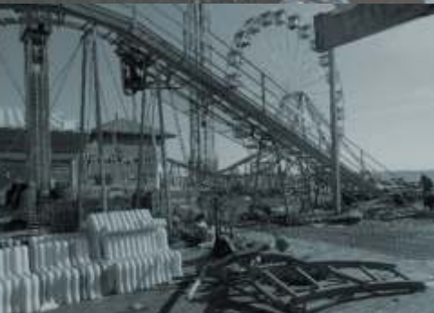
Seaside Heights Boardwalk & Pier Seaside Heights, New Jersey

Lastly, we remain steadfast in our dedication to our company values with focus on service at the forefront.