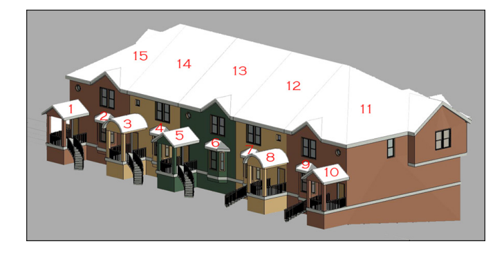
Figure 2 - A townhouse

This building has two roof sections shown as 1) the shingles/ tile and 2) built-up membrane. While the ridges and valleys do not constitute separations between roof sections, different material types do constitute separations.